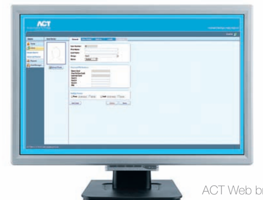
ACT Web browser